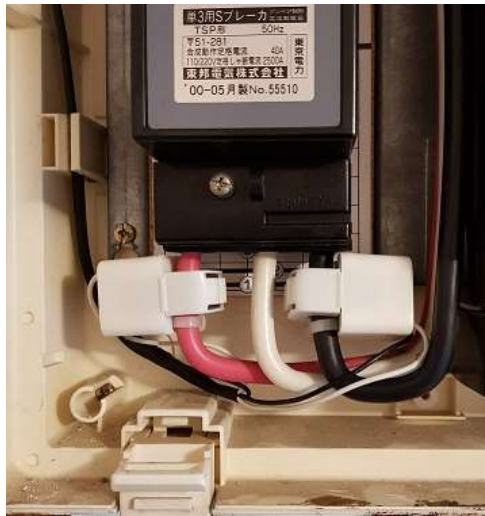
Current transformer installation